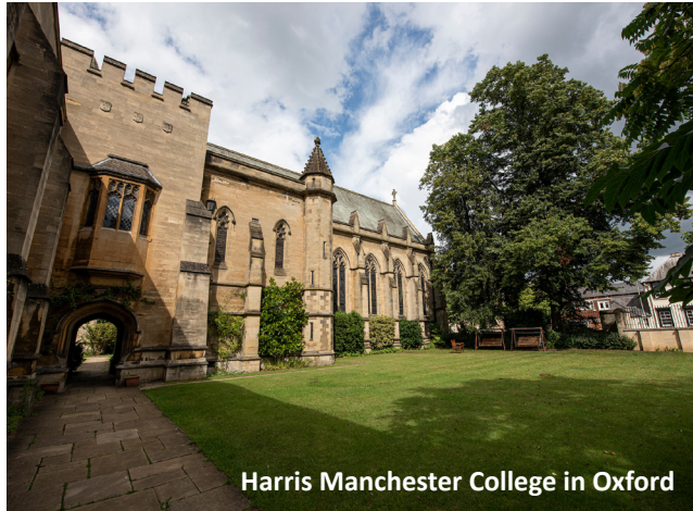
Harris Manchester College in Oxford