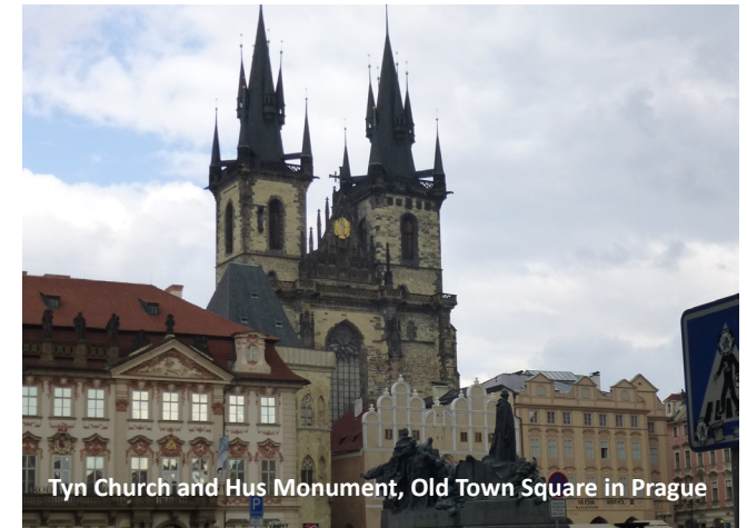
Tyn Church and Hus Monument, Old Town Square in Prague

For the Catholic Theological Faculty in Tübingen, “contemporariness” is a constant goal.