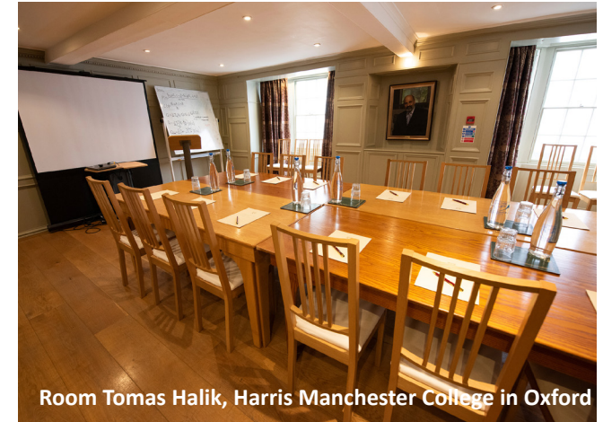
Room Tomas Halik, Harris Manchester College in Oxford